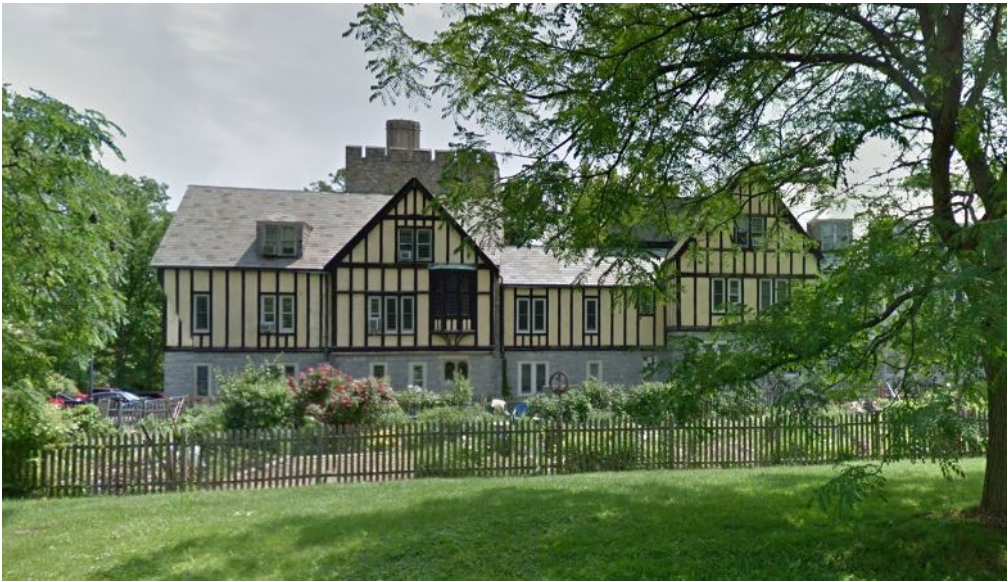
Tudor Façade Elevation