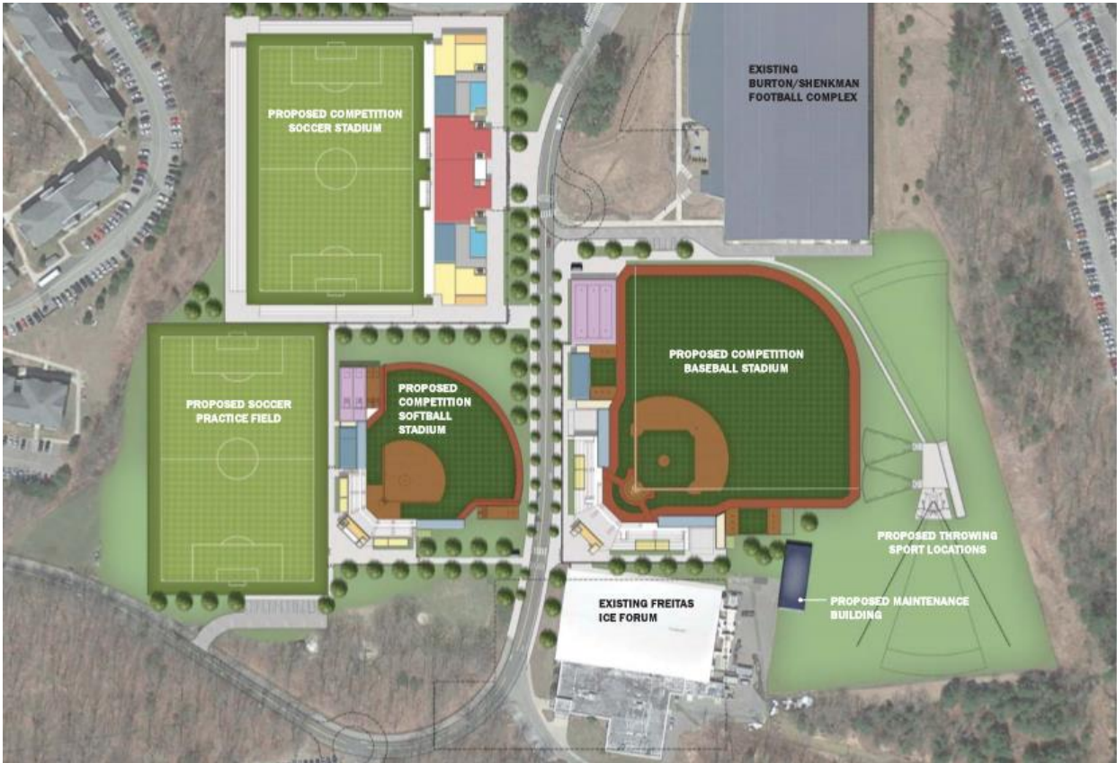
Phase 3 – Conceptual Site Plan