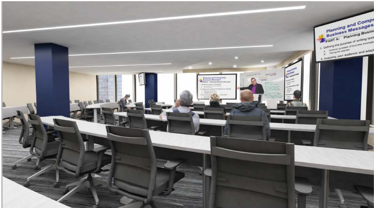
Proposed Classroom View