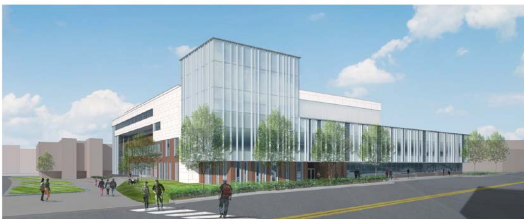
EXTERIOR DESIGN REVIEW