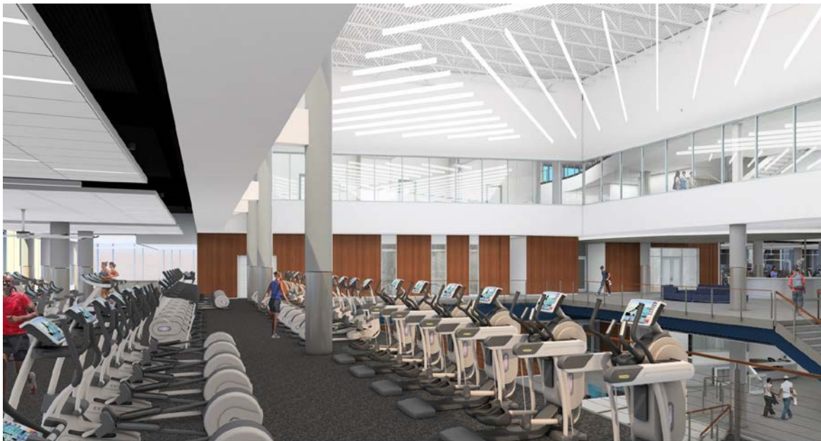
INTERIOR DESIGN REVIEW