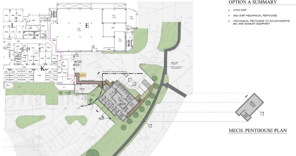
COMPOSITE BASEMENT / SITE PLAN - OPTION A

UCH MAIN ACCUMULATION AREA FACILITY UNIVERSITY OF CONNECTICUT 11.7.16