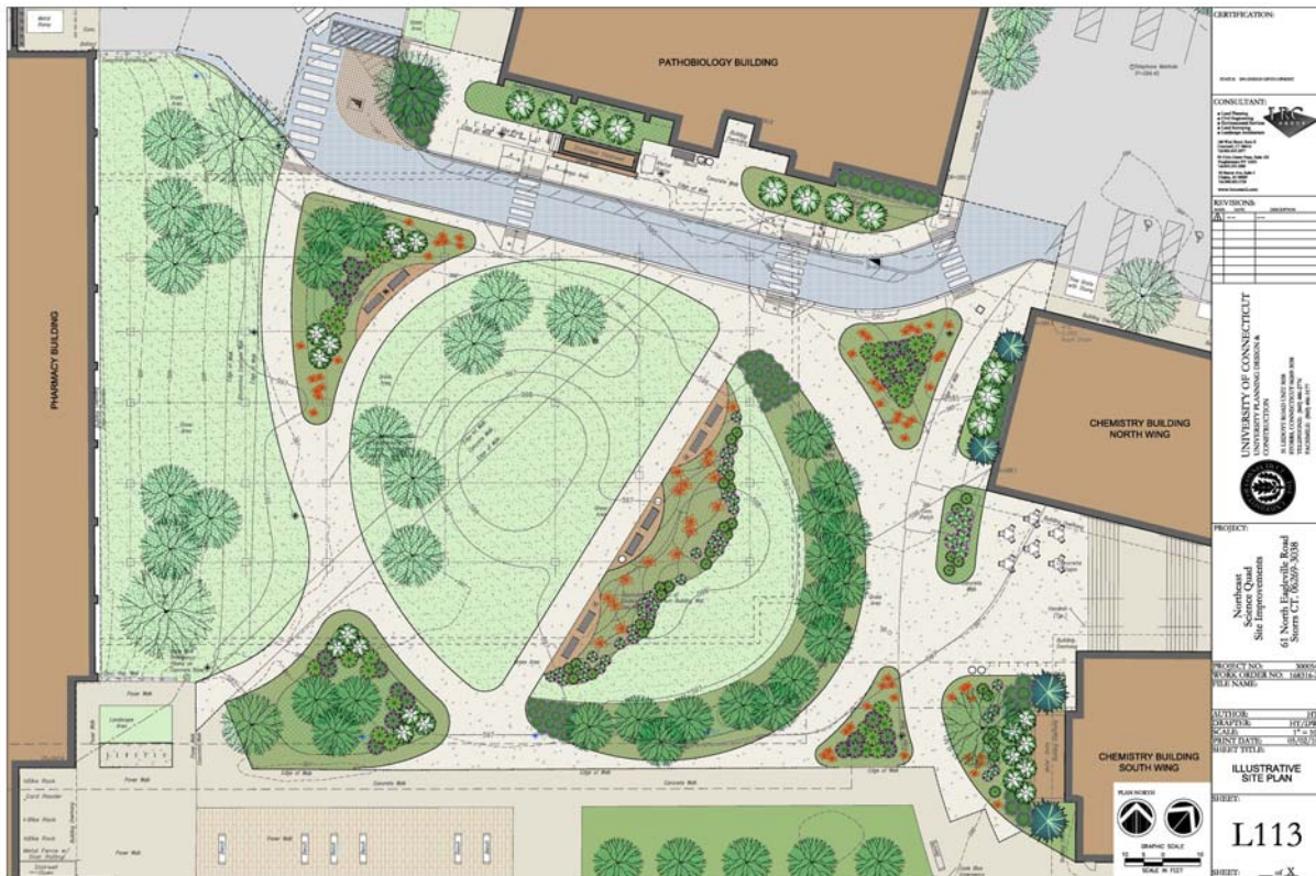
DESIGN DEVELOPMENT SITE PLAN (IN PROGRESS – SUBJECT TO CHANGE)