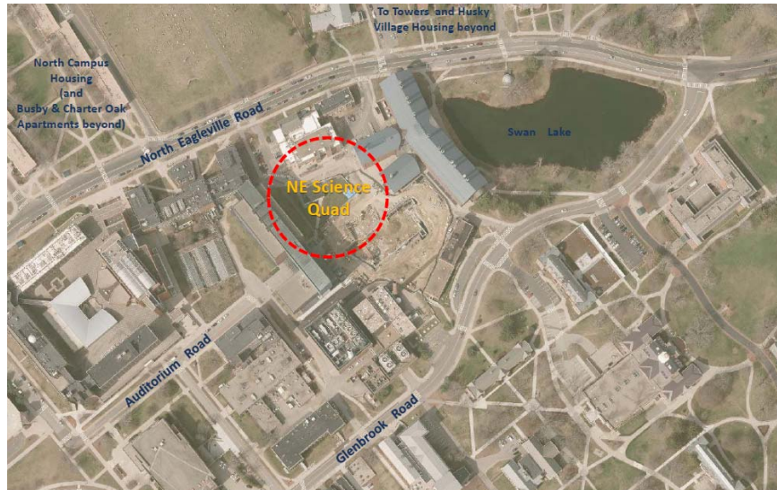
LOCATION OF IMPROVEMENTS