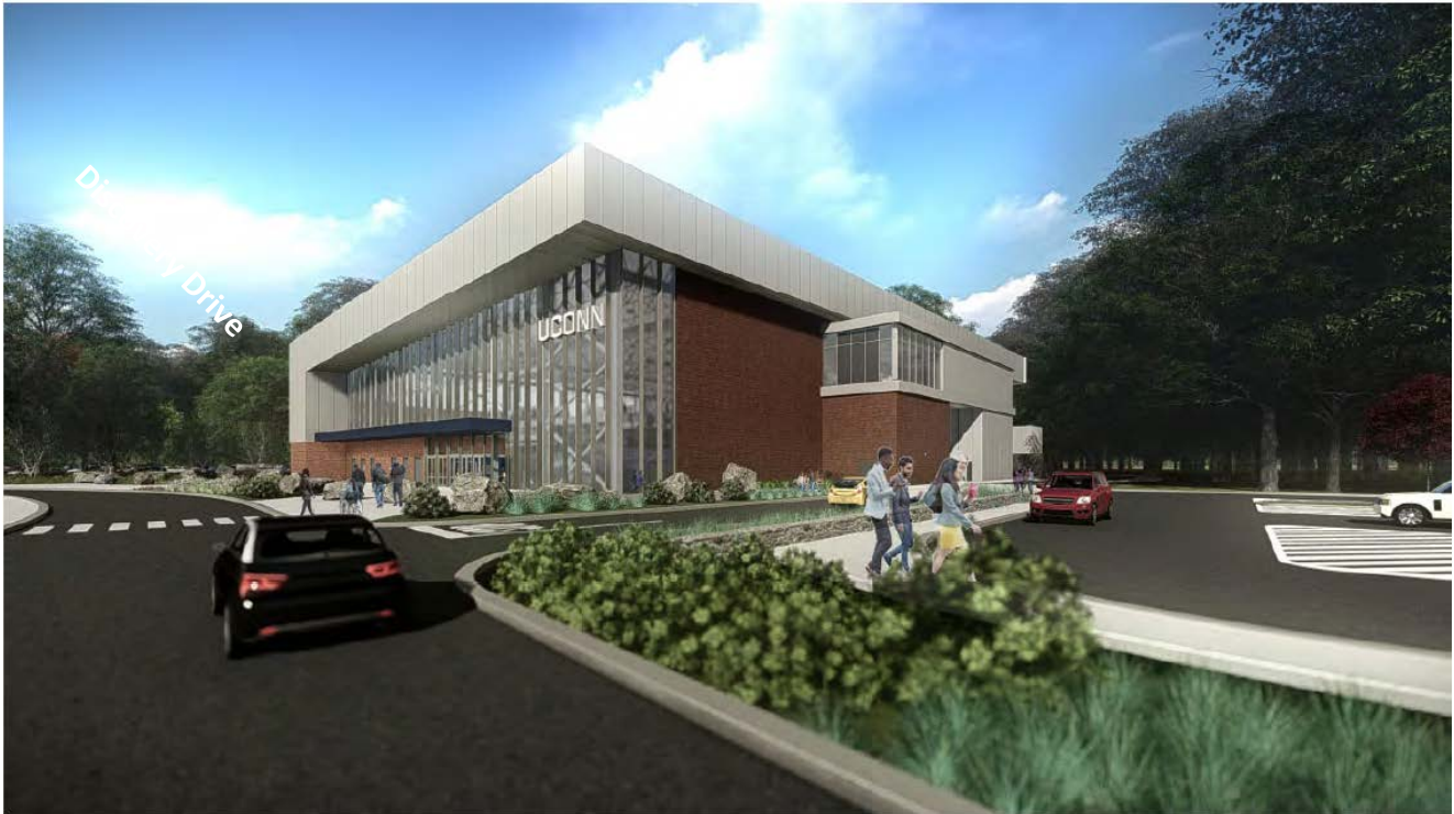
Northwest Elevation along Jim Calhoun Way