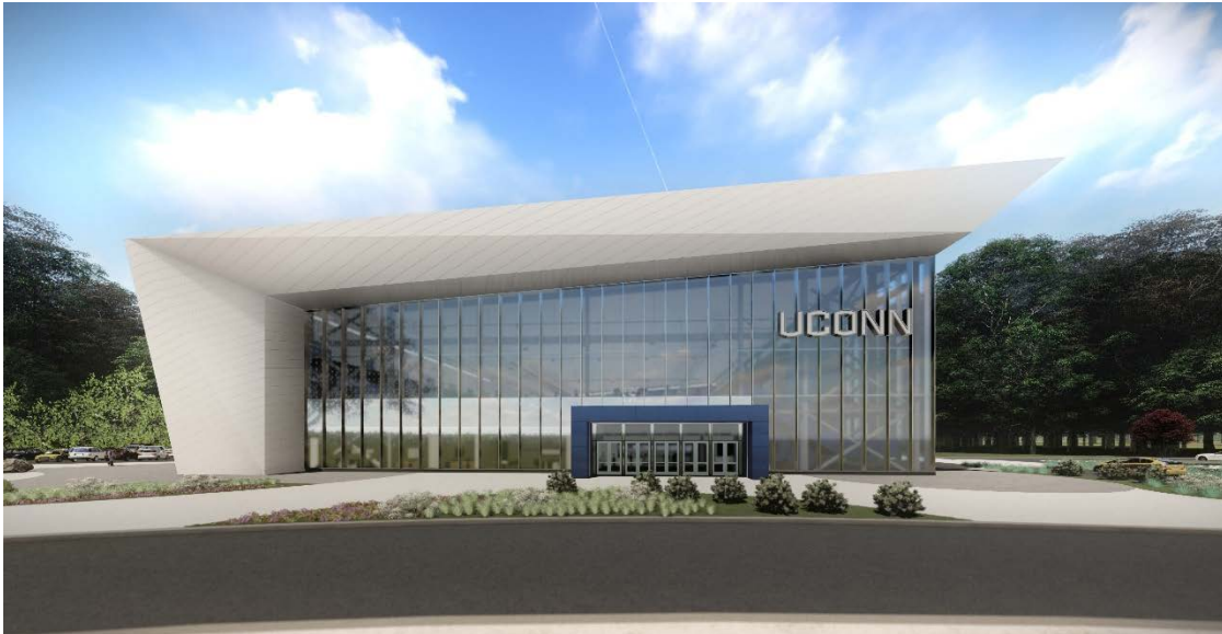
Northwest Elevation along Jim Calhoun Way