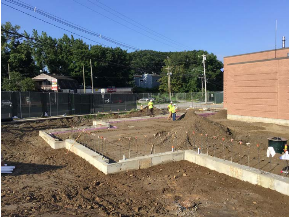
East Addition Foundation