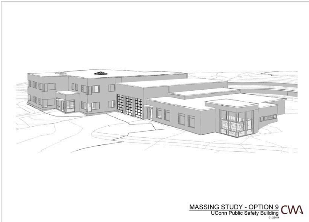
Addition Massing Study