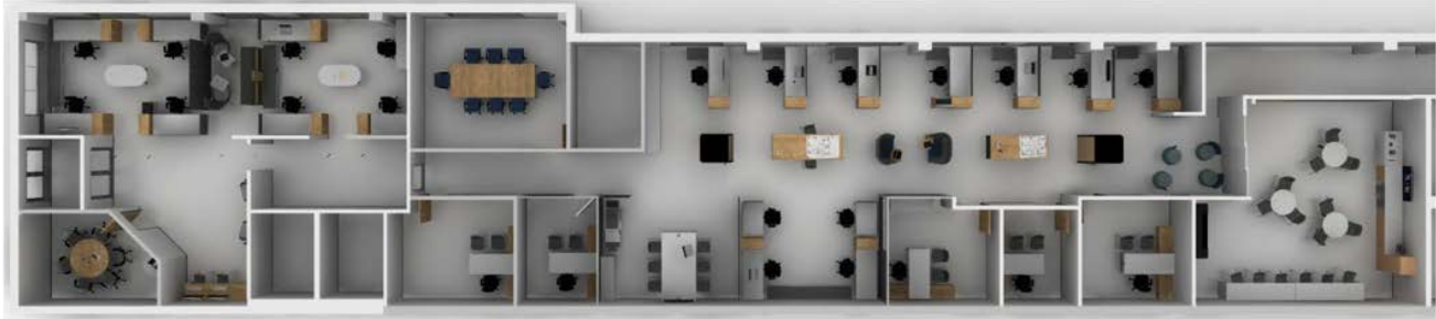
Floor Plan West