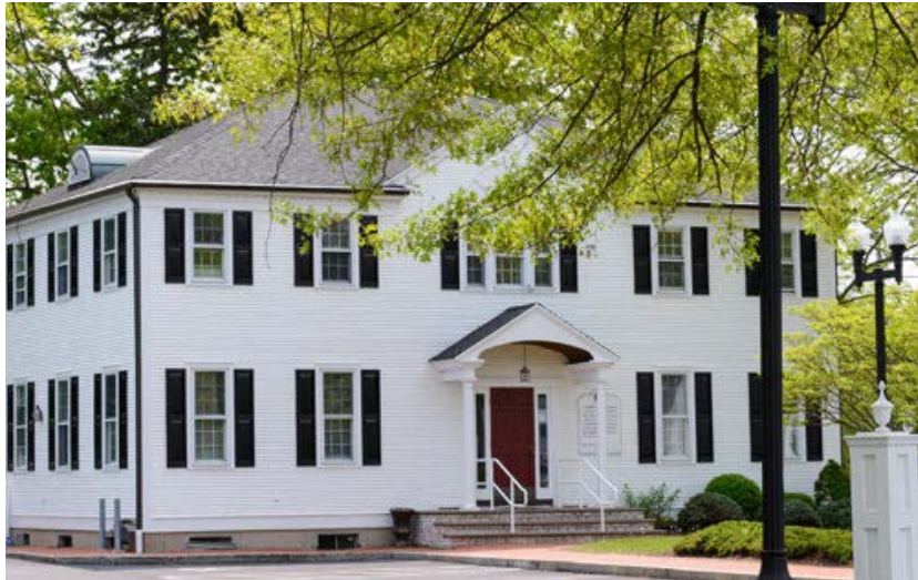
EXTERIOR VIEW OF EXISTING CANTON CLINIC