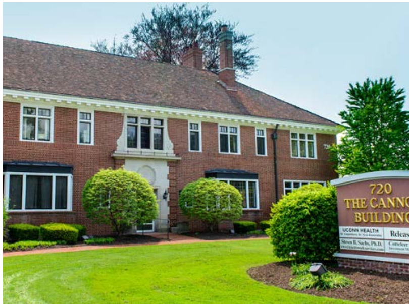
EXTERIOR VIEW OF EXISTING SIMSBURY CLINIC