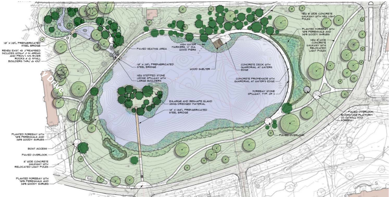
Proposed Improvements Plan – Basis of Design