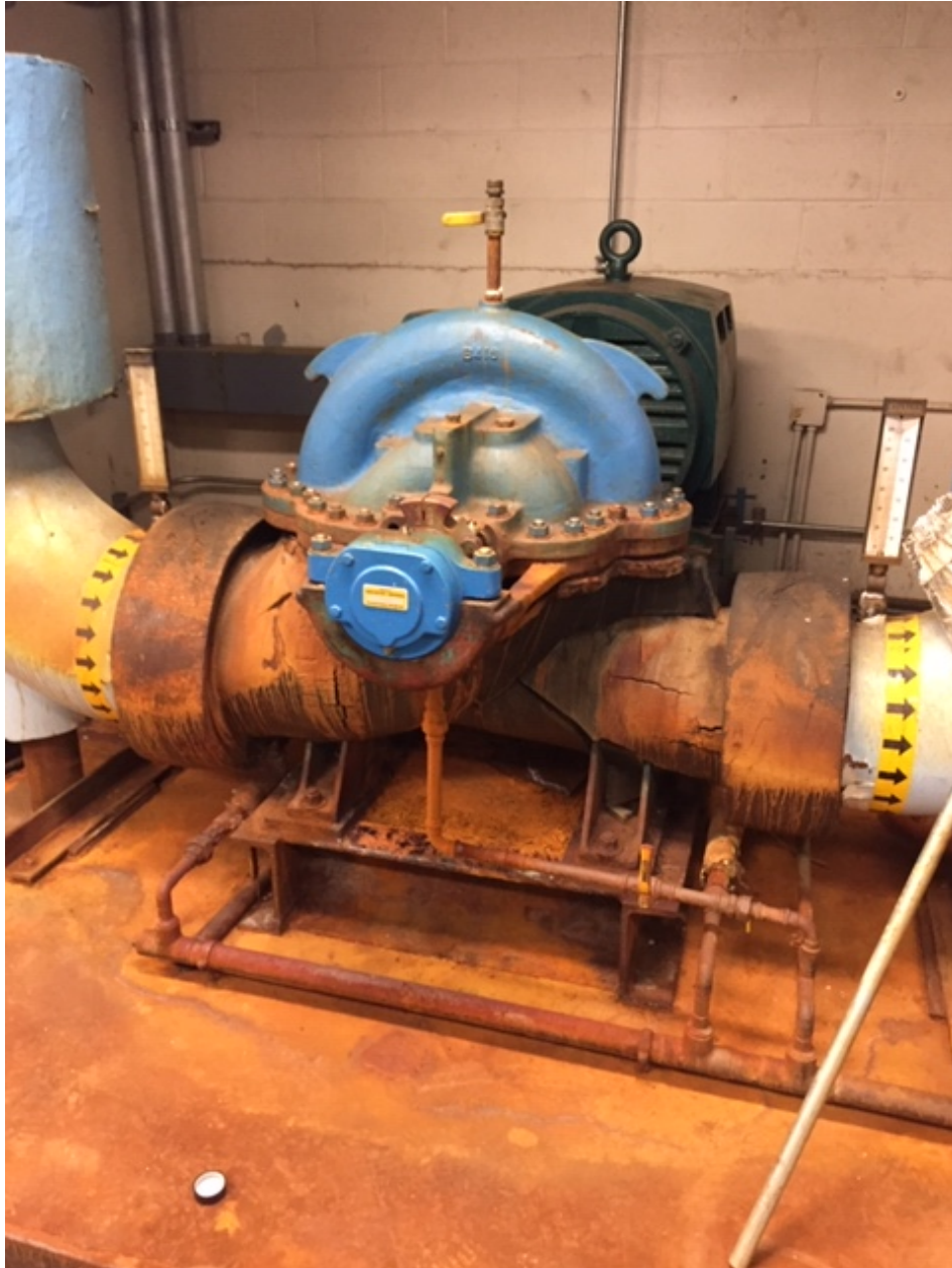
EXISTING CHILLED WATER PUMP #4