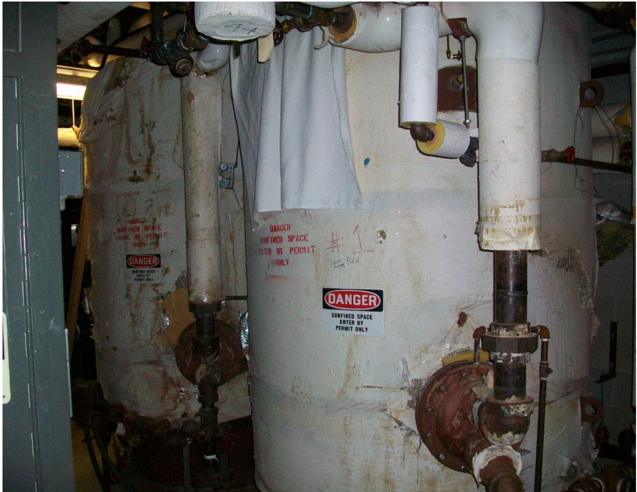
EXISTING STEAM-TO-HOT WATER HEAT EXCHANGER AND STORAGE TANKS