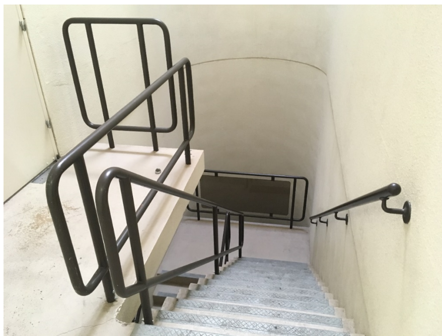
16 MUNSON ROAD NON-COMPLIANT EGRESS STAIR RAILING