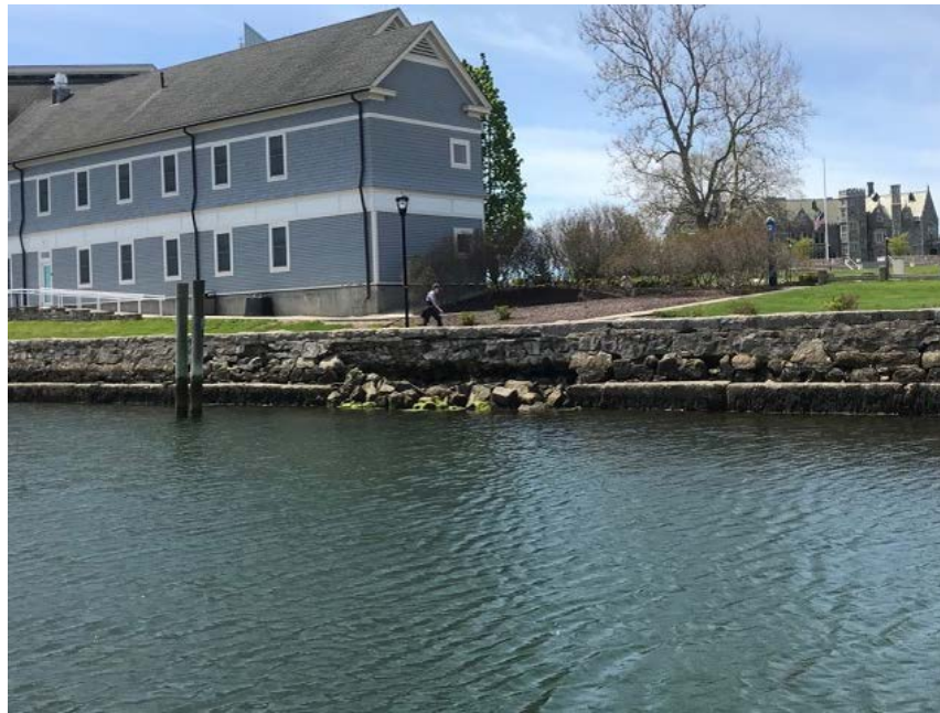
Condition of seawall adjacent to Project O Building, May 2020