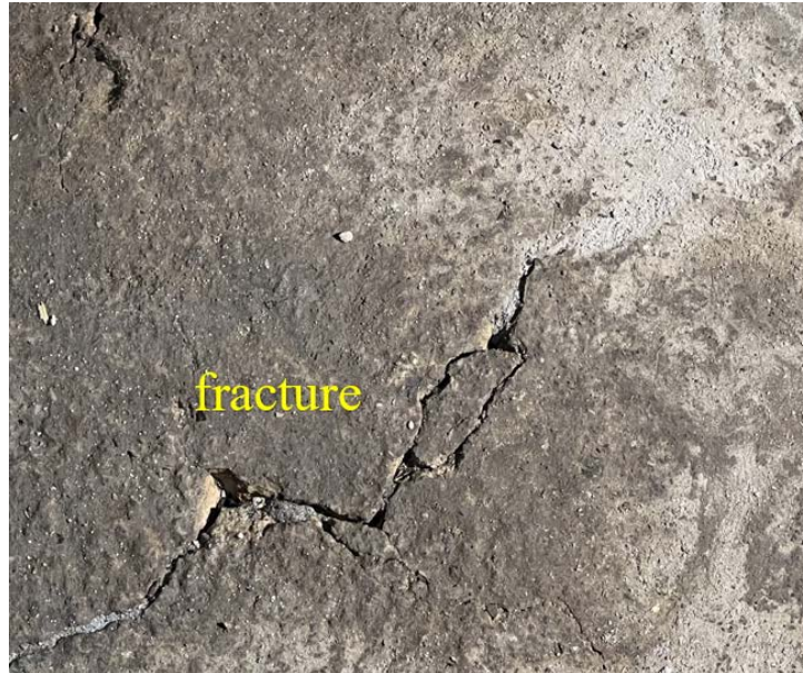
Elevator Pit Floor – surface view