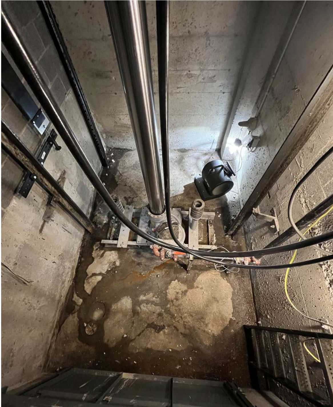
Elevator Pit Overview – new cylinder and equipment installed