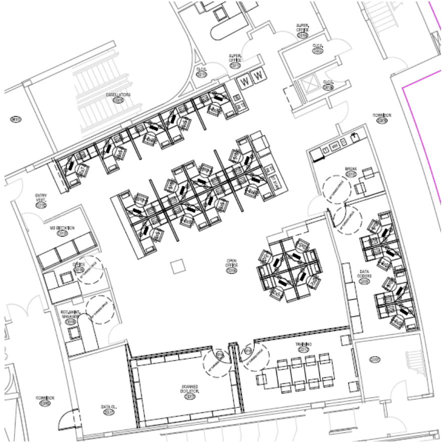
Proposed Floor Plan