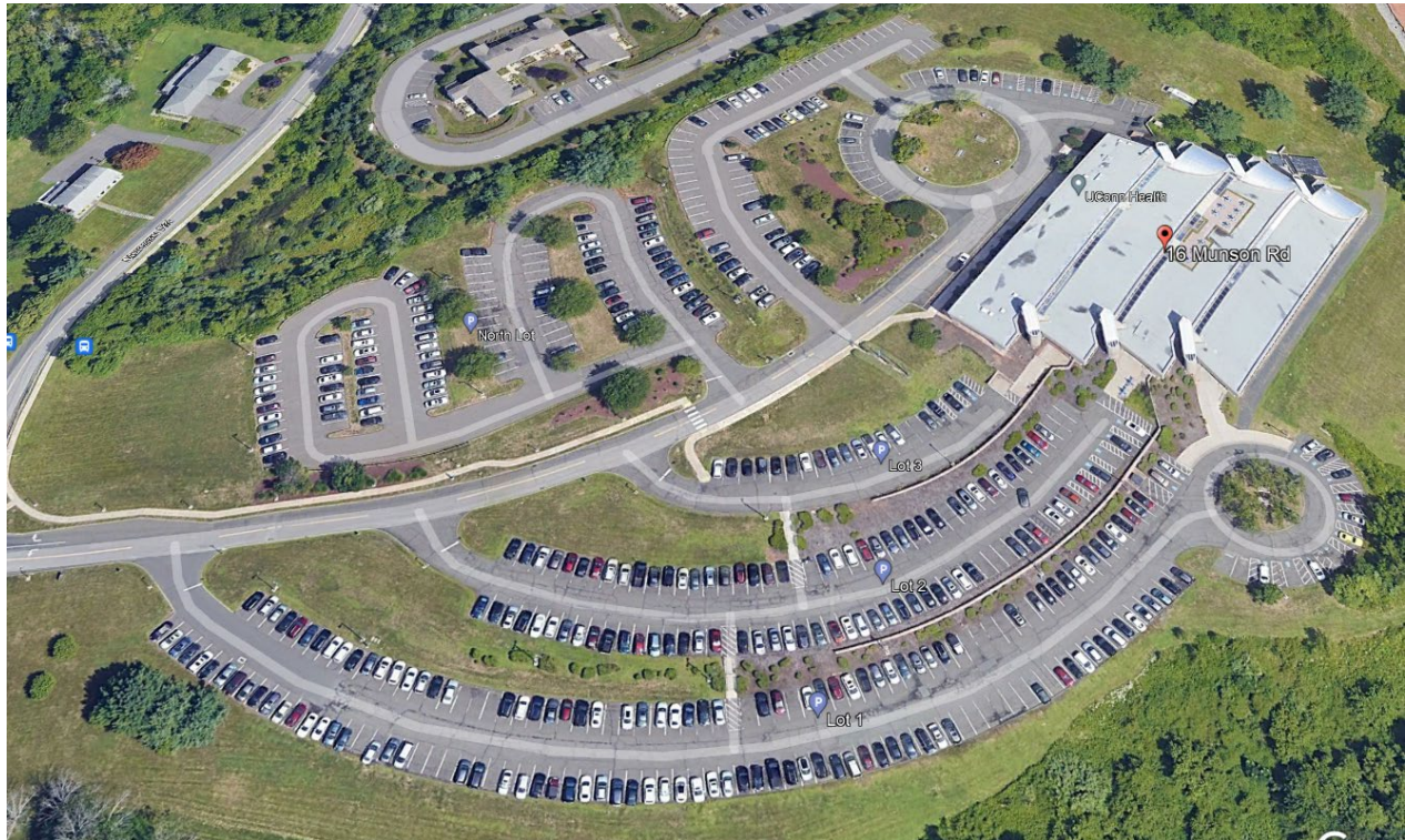
16 MUNSON ROAD PARKING LOTS