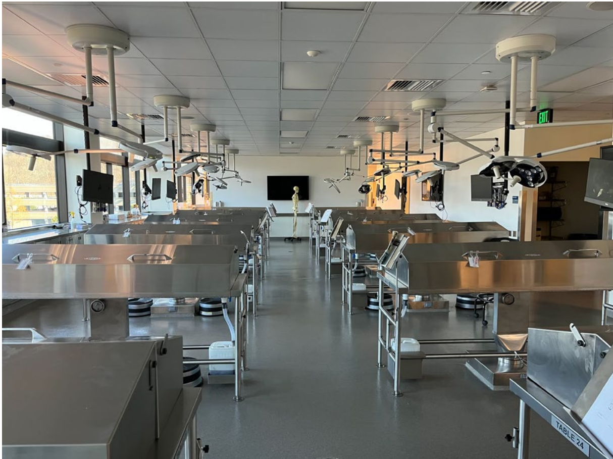
Cadaver Lab Rendering