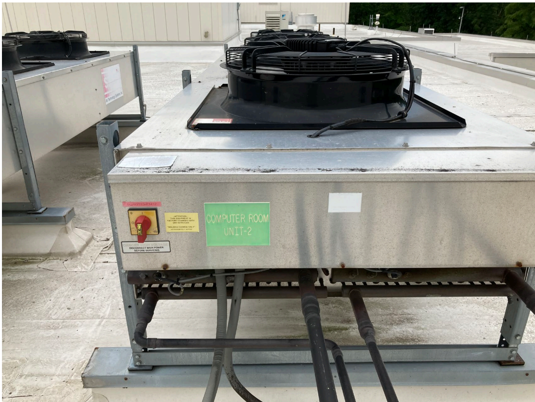
ROOF TOP COOLING UNIT