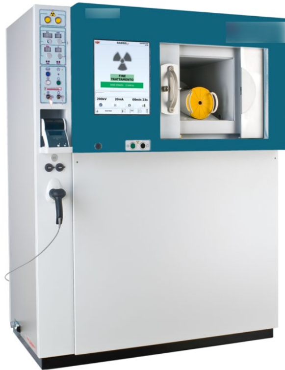
X-Ray Blood Irradiator