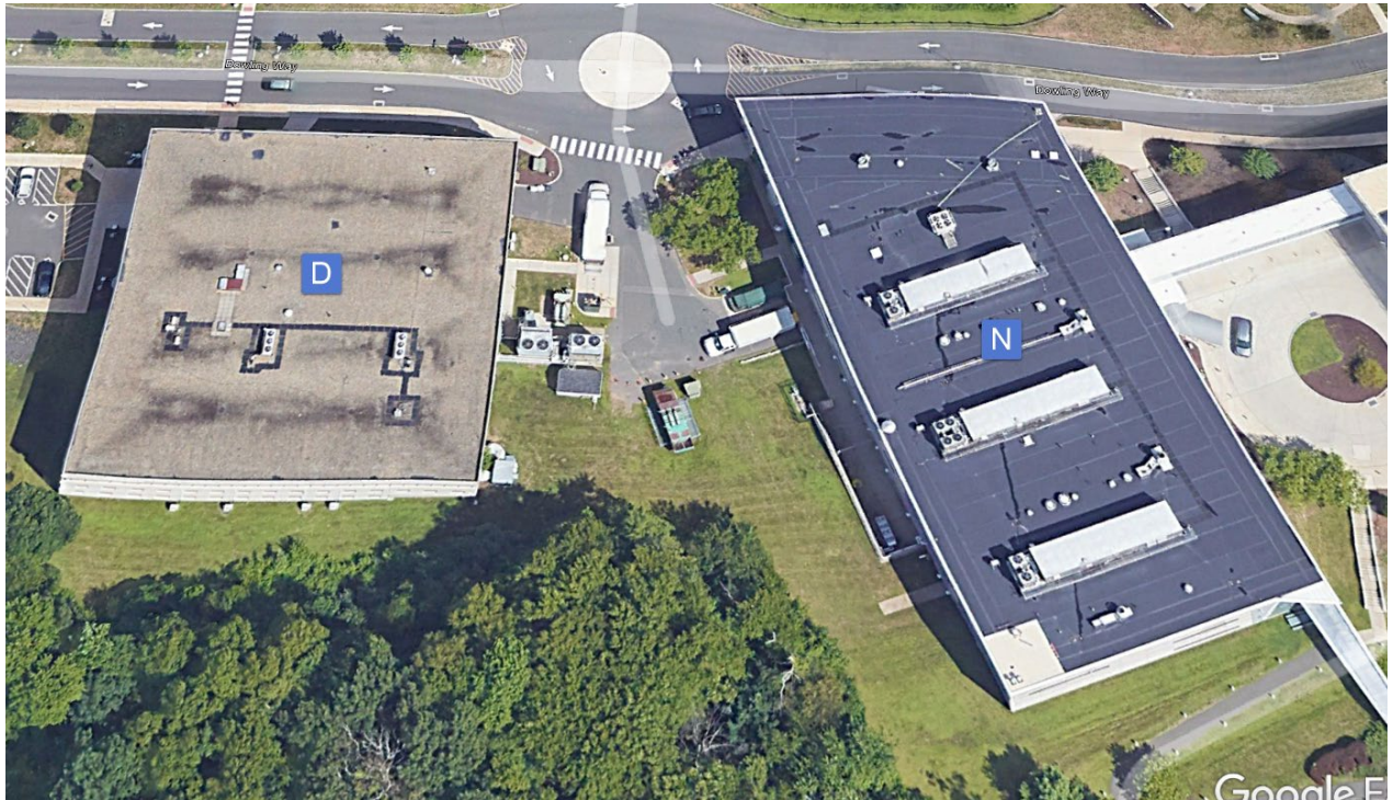
BUILDING D ROOF and BUILDING N ROOF