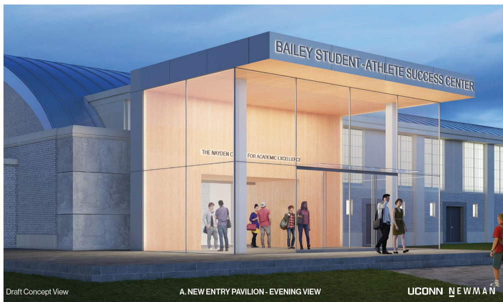
Concept Entry Pavillion to Athletic Success Center