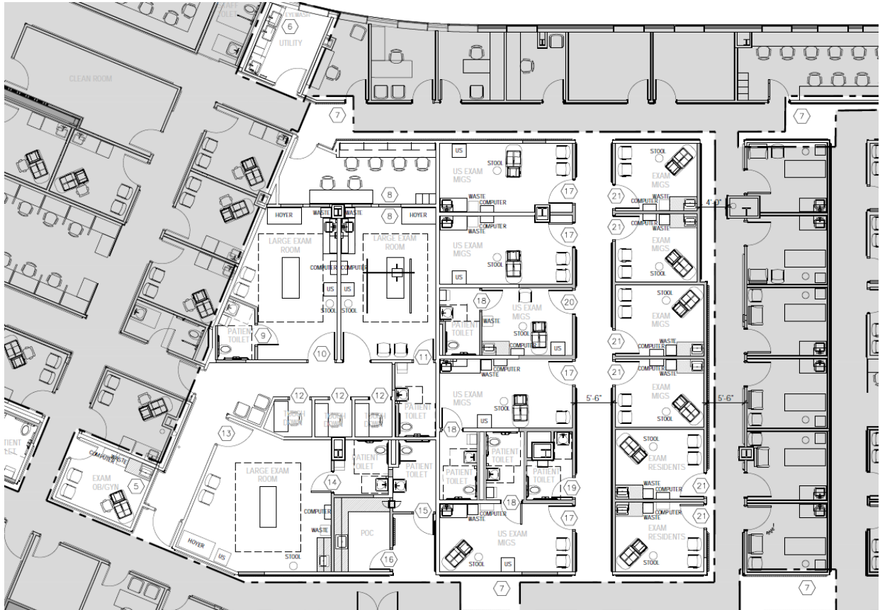
Conceptual Floor Plan