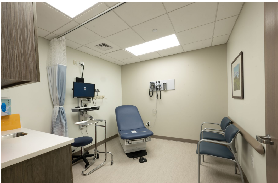
PICTURE OF TYPICAL EXAM ROOM