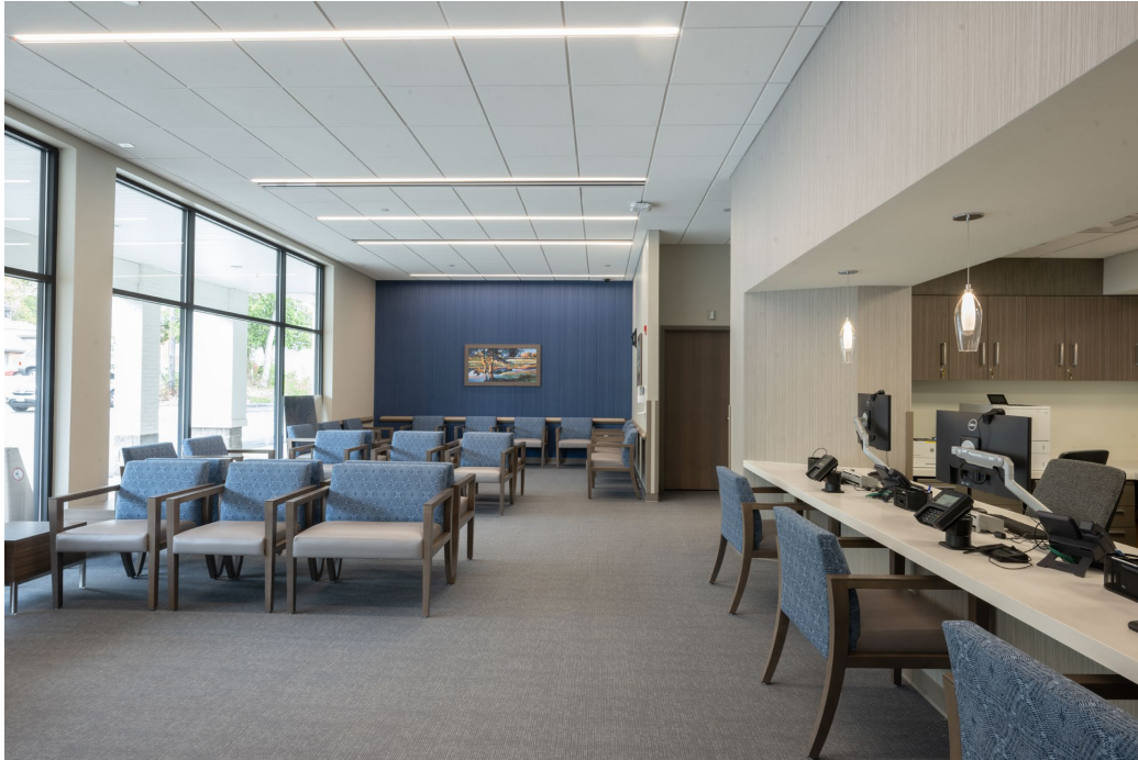
PICTURE OF NEW WAITING ROOM