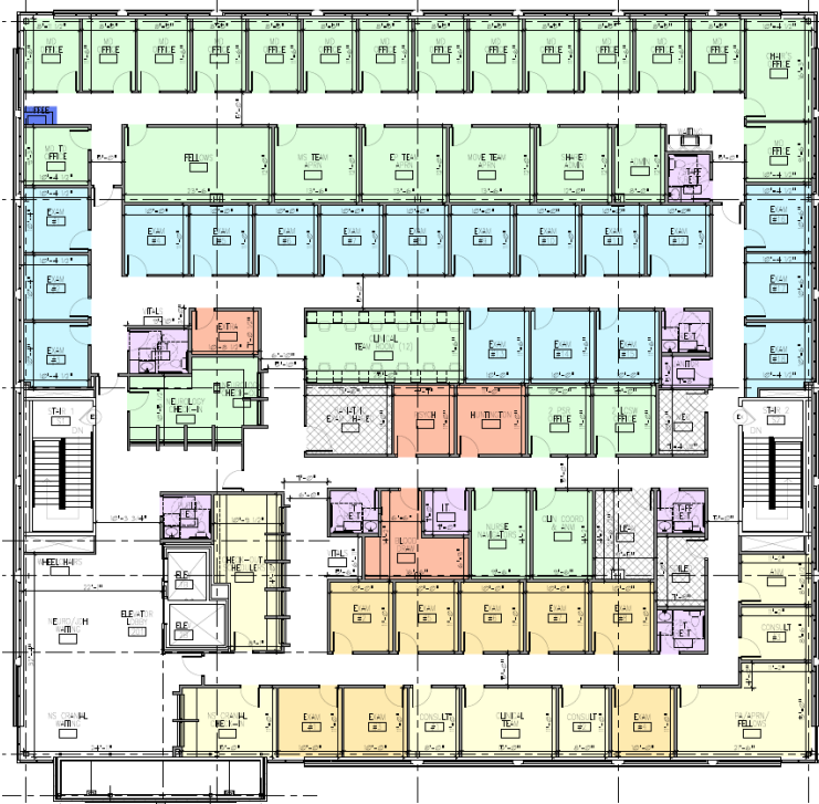
1 st Floor and 2 nd Floor Plans